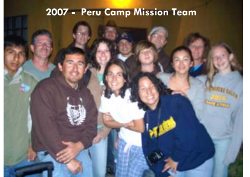
2007 - Peru Camp Mission Team

PLEASE PRAY FOR DC & SONJA KAUSHAL IN NORTHERN INDIA