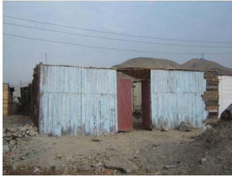
The Valle Verde feeding center operates out of this makeshift church building.