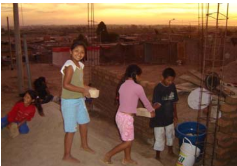
Pisco, Peru - At the end of the school and work day this family works together to build their new little house with supplies we were able to provide.

In this world there are so many needs and sometimes as a small ministry we're limited to what we can do, but God isn't and never will be! As needs come our way, we're learning more and more as a ministry, to believe God for His power and provision to do what we can't humanly do. God loves the people of the world far more than any of us do or can. With that in mind, it only makes sense, that God will answer the prayers aimed at helping the lost and hurting. Quite often, He does that through His servants. Thank you for your continued love and support in helping us meet the spiritual and physical needs of the poor and needy.