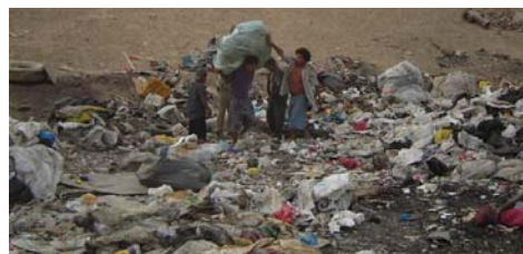
Ponte Piedre - This is where we are helping the church start the Ponte Piedre Feeding Center

The Ponte Piedre Feeding Center will open next week and will feed 60 children three times a week, the pastor says more will come. The cost will be about $150 a month or $1,800 a year, which isn't much when you consider that's 720 meals a month, and about 9,000 meals a year. If you would like to help please let us know. Perhaps you, your church or youth group would like to take on the support of this center. We'll send you a picture of the kids for you to remember to pray for them on a regular basis. Perhaps you'll visit sometime and minister in Ponte Piedre.