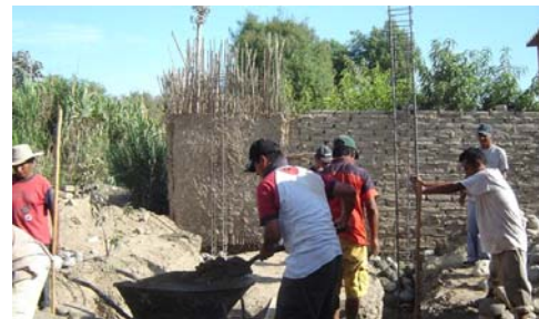
Chincha - The Mission Team from Lima at work.