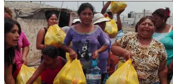
BAGS OF FOOD AND WATER FOR MANY FAMILIES IN NEED