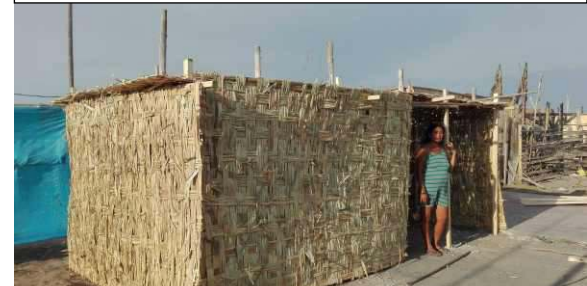
TEMPORARY SHELTERS FOR FAMILIES IN NEED IN PISCO