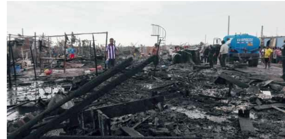
100 HOMES BURNED TO THE GROUND IN PISCO